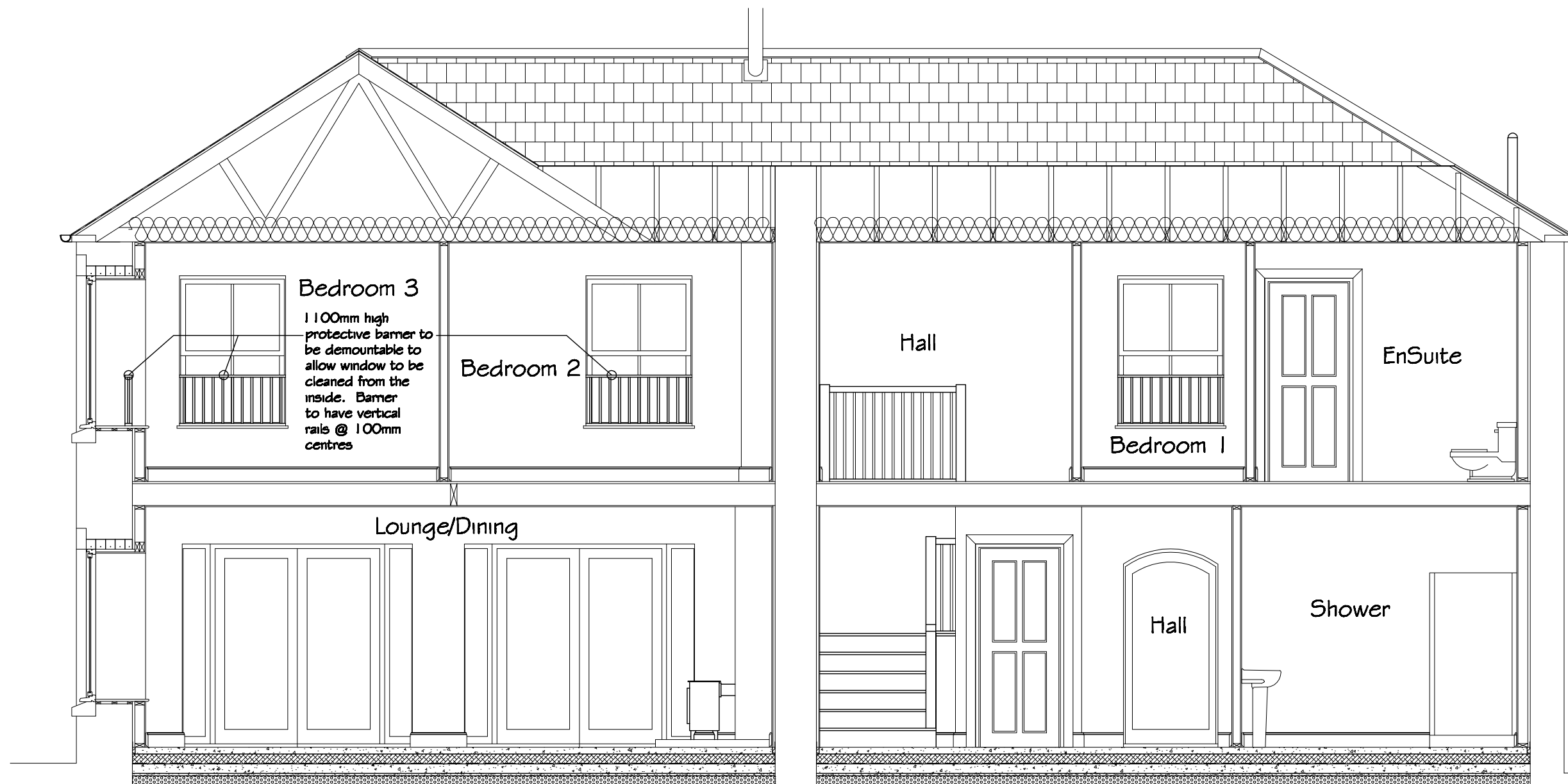
SECTION B-B 1/50

N.b. All existing opening sizes, timber sizes, roof pitch etc. to be checked on site by contractor before any work is put in hand. Figure dimensions only are to be taken from this drawing. All dimensions are to be checked on site BEFORE any work is put in hand. If in doubt, ASK.