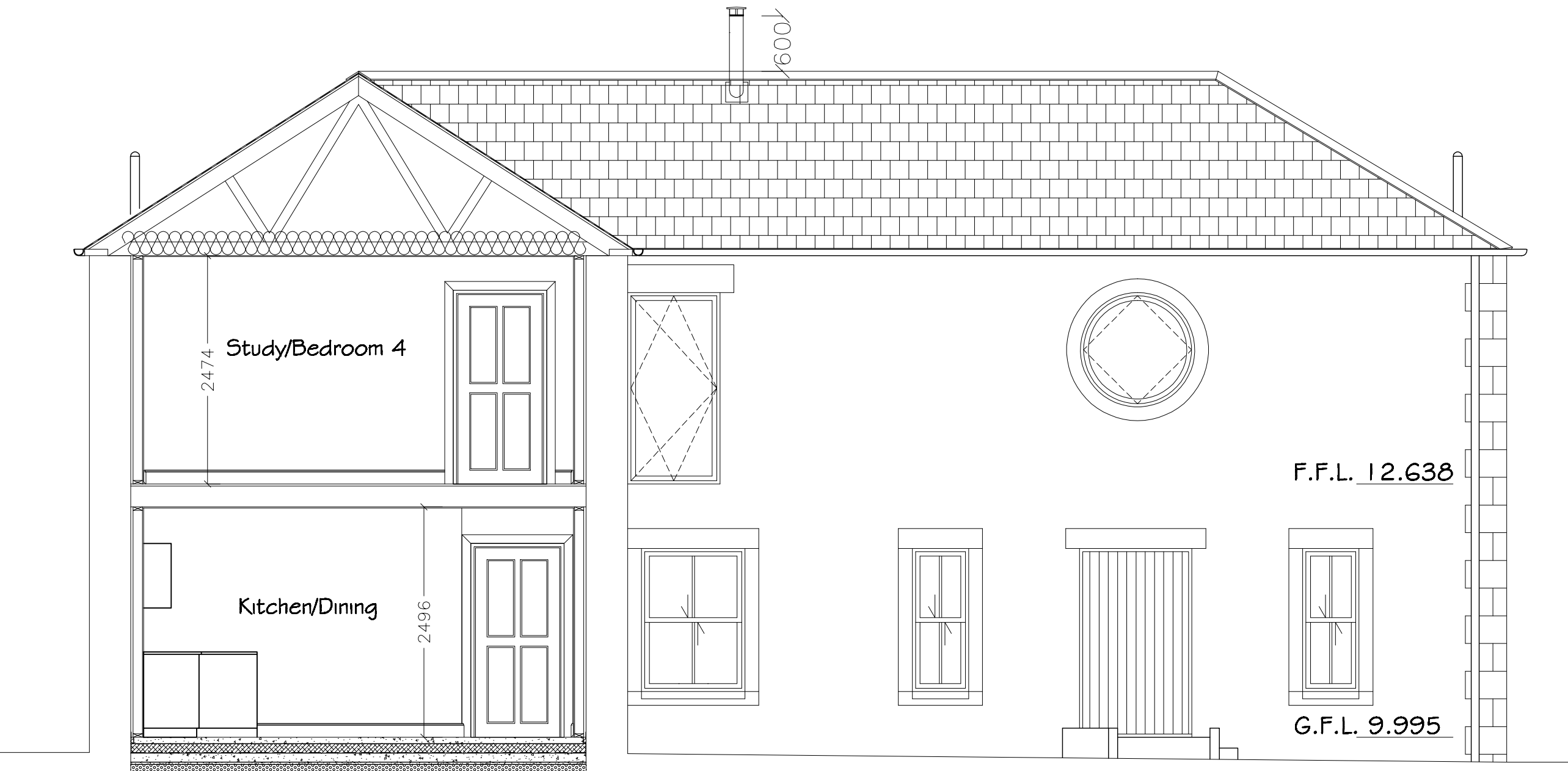
SECTION A-A 1/50

N.b. All existing opening sizes, timber sizes, roof pitch etc. to be checked on site by contractor before any work is put in hand. Figure dimensions only are to be taken from this drawing. All dimensions are to be checked on site BEFORE any work is put in hand. If in doubt, ASK.